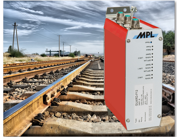
GUARD with M12 and flange

* Typically 10 years or more, 20+ years repair-ability