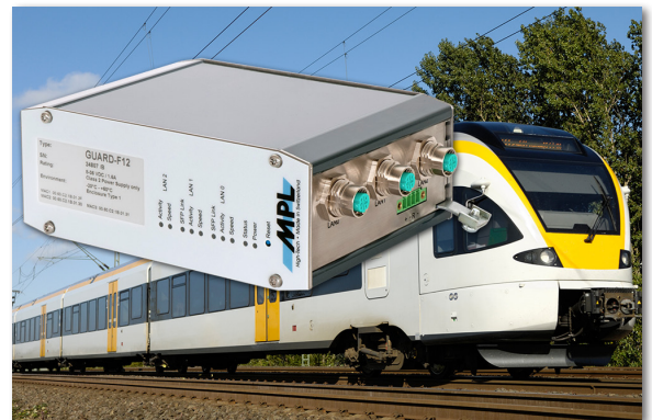
GUARD with M12 and DIN-Rail mounting