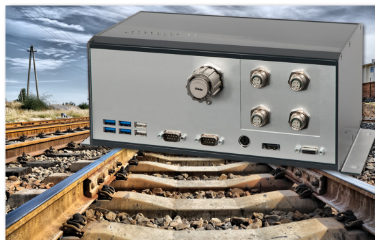
RAIL-PIP37 used in rugged railway application, Profibus & LAN ports on M12 connectors.