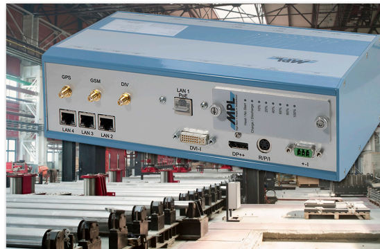
PIP38 used in harsh environments, equipped with UPS and removable battery, GPRS, GPS, and PoE.

All MPL products are 100% designed and manufactured in Switzerland.