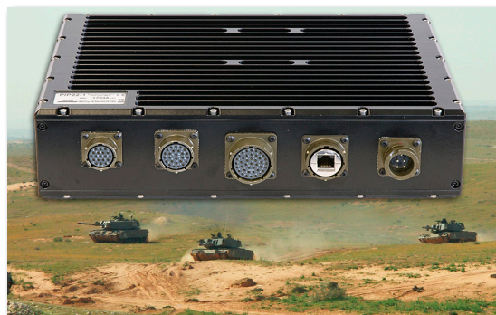
MIL-PIP32 for rough use in military environment as communication controller.