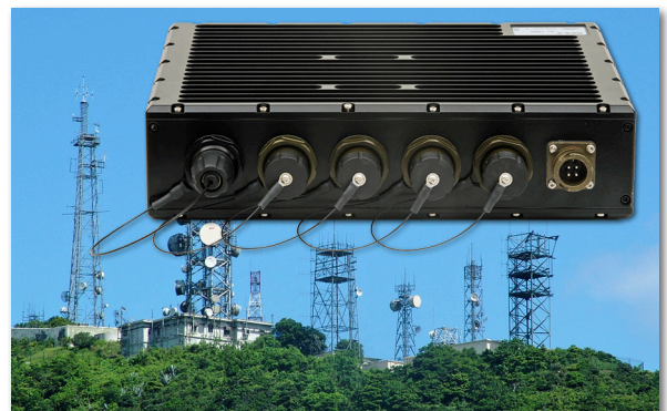
MIL-MAGBES-10 for rough use in Military Environments