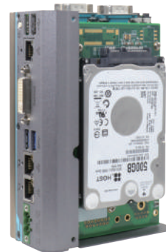
▲ POC-300 with MeziO™ - R11 and 2.5" HDD

** For sub-zero operating temperature, a wide temperature HDD drive or Solid State Disk (SSD) is required.