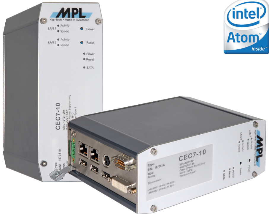
CEC7 dimensions: 62 x 162 x 118 mm (W x H x D) Compact rugged aluminum housing with stainless steel side plates

the CEC7 to the ideal solution for applications where a low power consumption, ultra Compact Embedded Computer is required. The CEC7 can be used in application like transportation systems, telecom and in tough industrial automation applications.