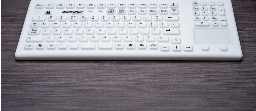
TKG-107-TOUCH-IP68-WHITE-MAG-BACKL InduProof® Smart Pro