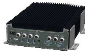
▲ SEMIL wall-mounted