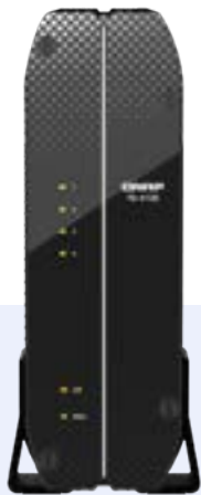
iRM-TSi410E Hardware Dimensions (Unit: mm)