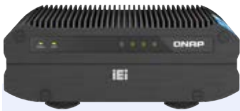
iRM-TSi410X Hardware Dimensions (Unit: mm)